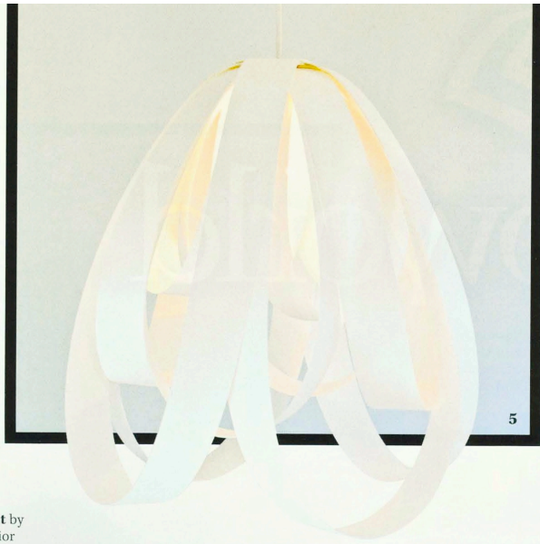
5. The Suzanne pendant light by London architecture and interior design firm 7Gods is made of die-cut paper strips ($200; 7gods.co.uk ).