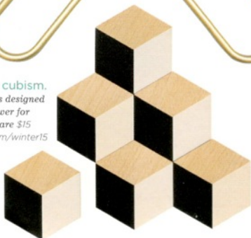
Kitchen cubism. Table tiles designed by Bower for Areaware $15 domino.com/winter15