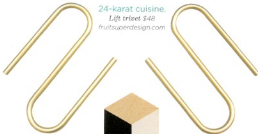
24-karat cuisine. Lift trivet $48 fruitsuperdesign.com