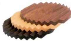
Crinkle-cut coasters. Zig Zag trivet $125/set of three, patkimdesign.com