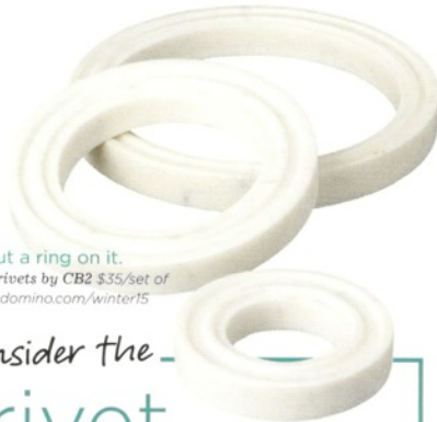
Put a ring on it. Marble trivets by CB2 $35/set of three, domino.com/winter15