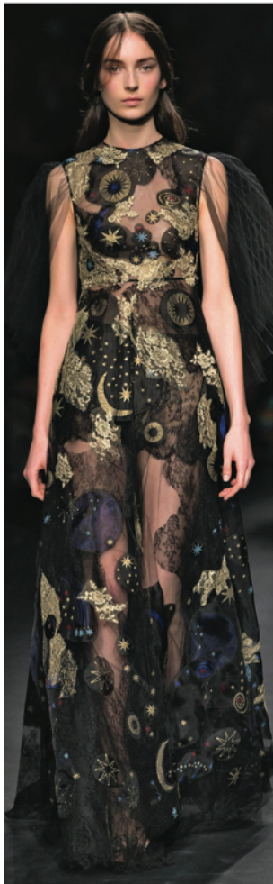
| Star Power Flecked with gold and dabbed with bits of midnight blue, Valentino's Celia Birtwell Constellation Print Embroidered Gown ( valentino.com ) is a dead ringer for Albertine, the magical French bookshop and reading room in NYC's Payne Whitney Mansion ( albertine.com ).

PEOPLE, PLACES & PRODUCTS YOU SHOULD KNOW ABOUT PRODUCED BY TORI MELLOTT